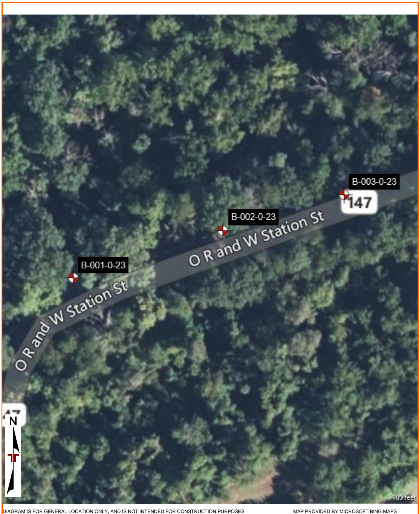
DIAGRAM IS FOR GENERAL LOCATION ONLY, AND IS NOT INTENDED FOR CONSTRUCTION PURPOSES